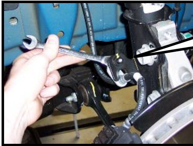
BRAKE LINE BRACKET