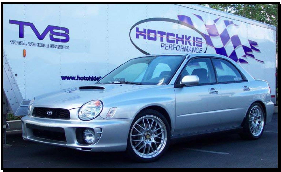
Another satisfied sway bar set customer.

Visit Hotchkis on the web at <u>www.hotchkis.net</u> or Call (562) 907-7757 to order!