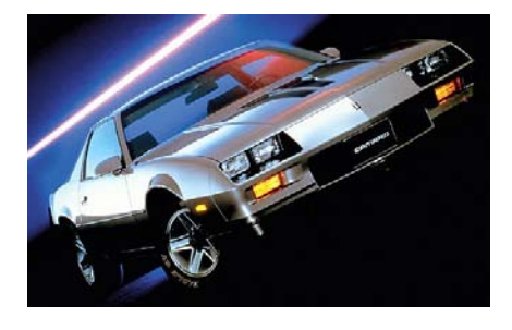
Front Bar Installation