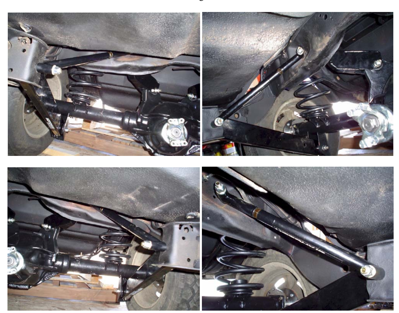
NOTE: For 78-88 models (part #1401) the curved section fits next to the lower trailing arm between the rear seat pan and the frame cross-member as shown in the photos below.

8) The brace can now be installed by sliding it over the bolts. The braces connect the upper and lower trailing arm frame mounts as indicated by the arrows in the photo from step 7. The longer section of the brace fits next to the lower trailing arm.