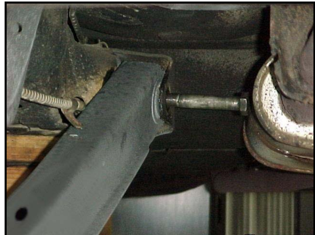
The hardware at the rear of the arm is easily accessed and should be removed. With all the hardware removed the stock arm should drop out of place.